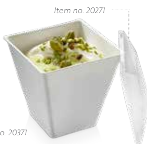
Item no. 20271