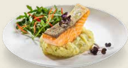
Item no. 31552