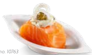
Item no. 10763