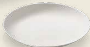
Item no. 31550