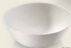
Item no. 31547