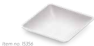
Item no. 15356

In response to the increasing urgency of environmental protection, single-use products containing polymers (such as plates, bowls, cutlery and drinking straws) have been banned in the EU since July 2021. Our sugar cane range is not only an eco-friendly alternative, but also an attractive and perfect solution that complies with the requirements of this legislation.