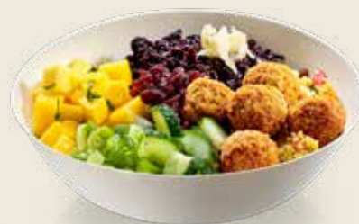
Item no. 31549