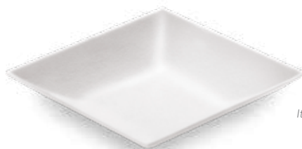
Item no. N465