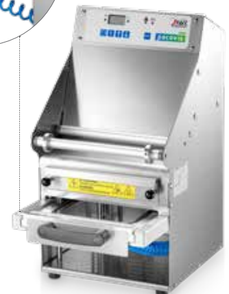
Item no. 30471