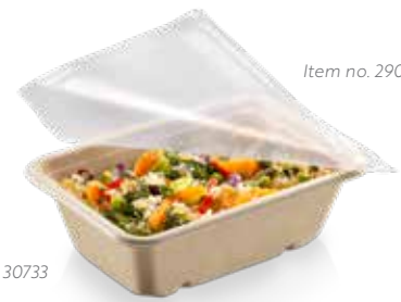
Item no. 29042