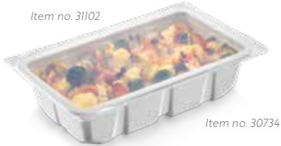
Item no. 30734