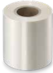
Item no. 29042